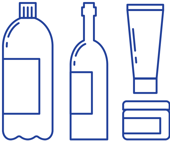
LARGER THAN 100 ML